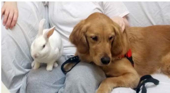
Tanzen (Golden Retriever) and McFlurry (Rex rabbit), from the Humane Society's pet visitor program